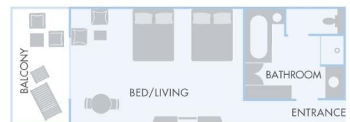
2 x Queen Bed Configuration