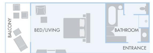
1 x King Bed Configuration