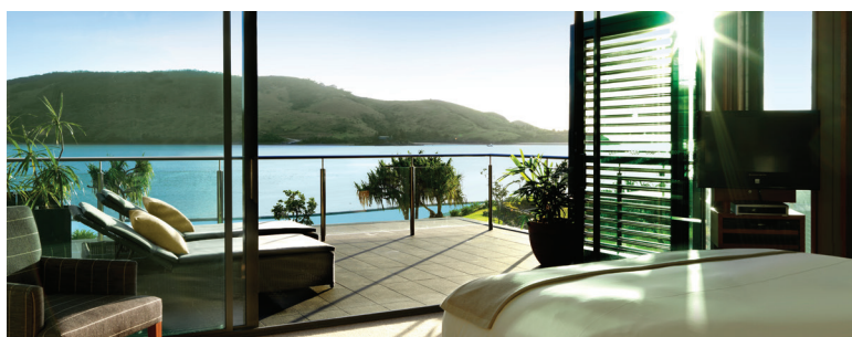
Yacht Club Villa