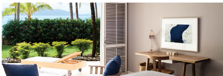
Beach Club Room