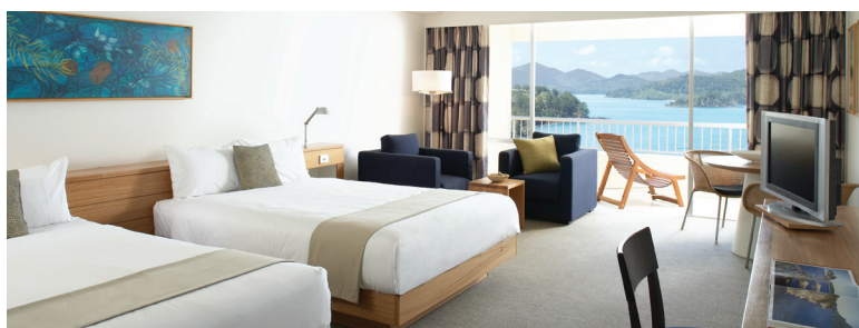
Coral Sea View Room, Reef View Hotel