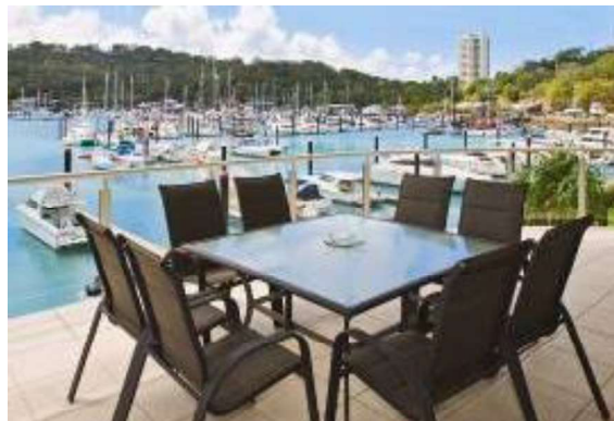
3 Bedroom Luxury