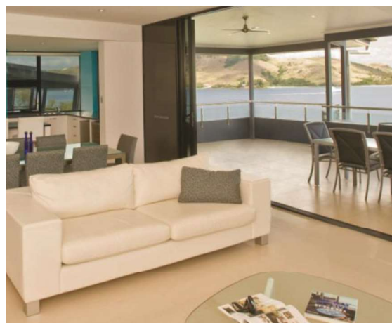
3 Bedroom Deluxe