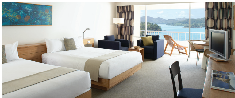
Coral Sea View Room, Reef View Hotel

Max. room capacity: 2 adults and 2 children 12 years and under