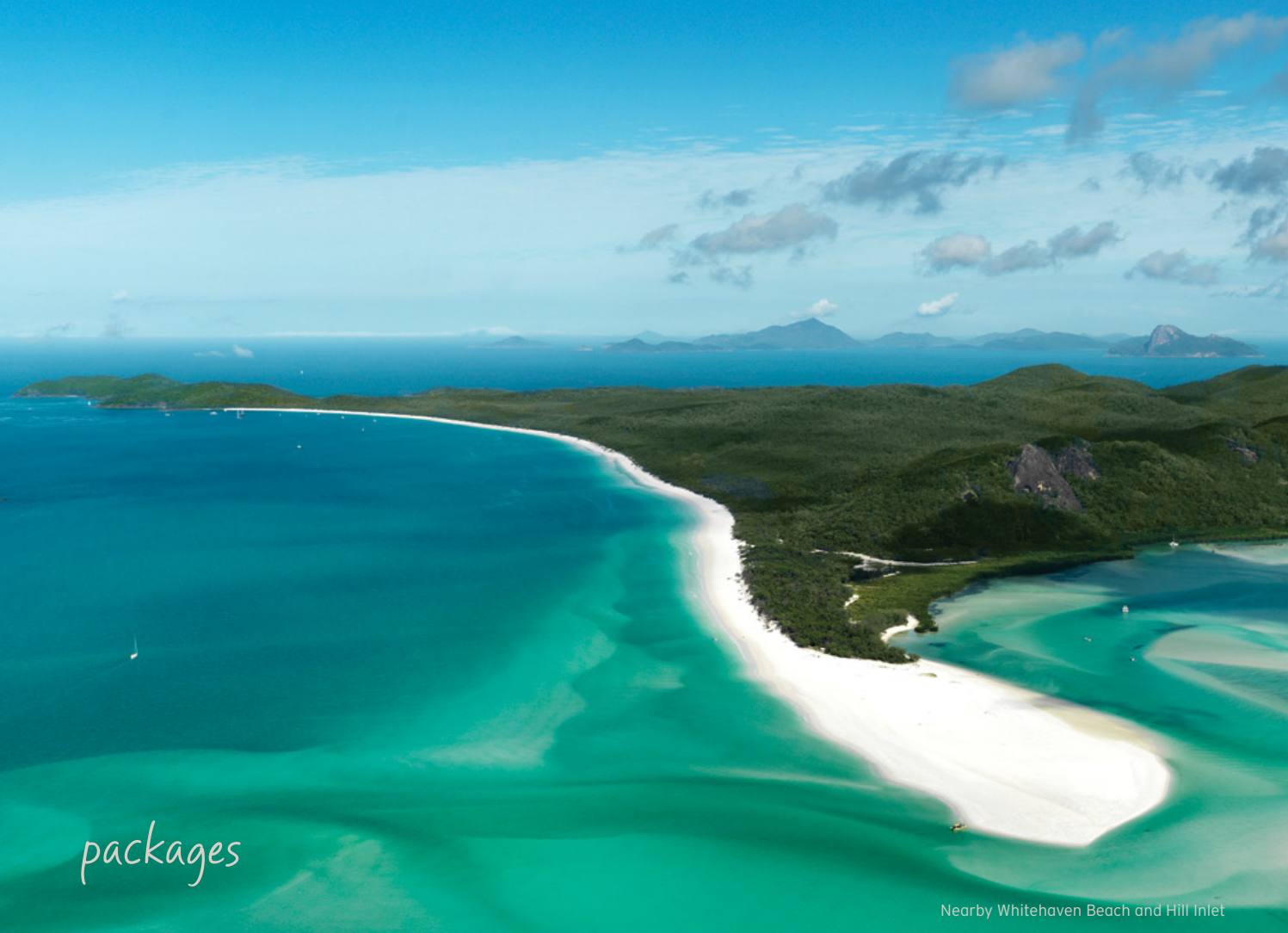
Nearby Whitehaven Beach and Hill Inlet