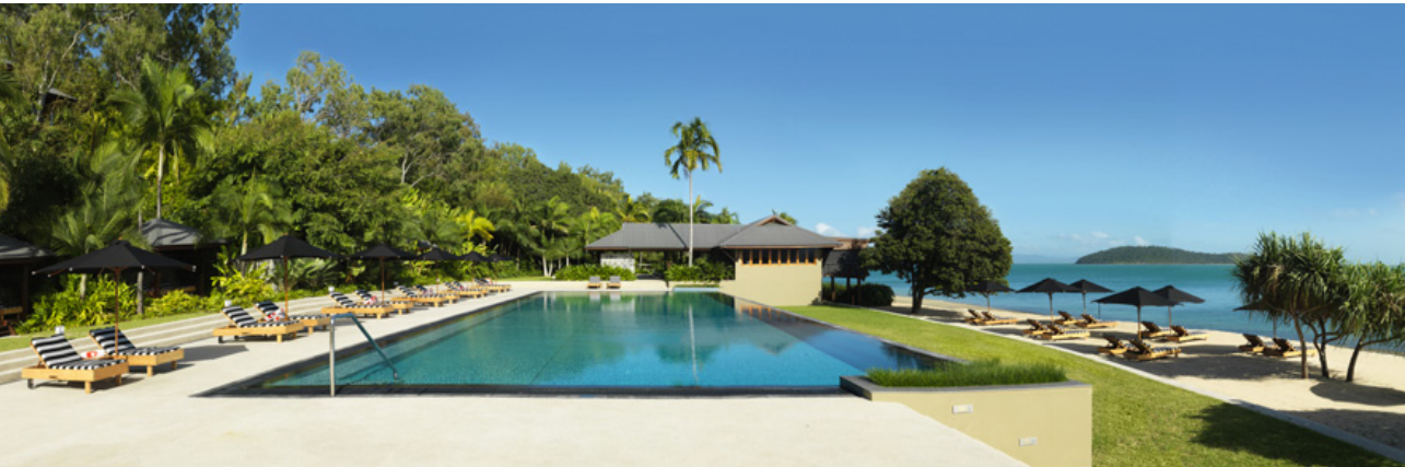
Pebble Beach Pool

Note: for pavilion locations, please refer to the map on the back page. qualia does not cater for persons under the age of 16 years. For luxury family options on Hamilton Island, visit www.hamiltonislandyachtclubvillas.com.au