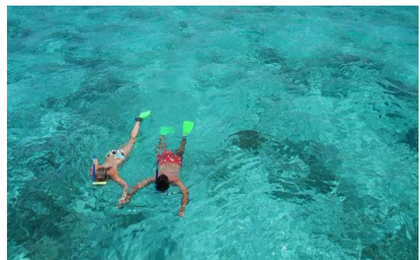
Day trip to the Great Barrier Reef