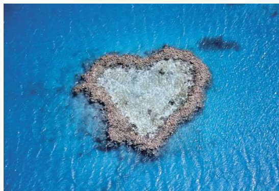
Heart Reef Great Barrier Reef

Additional charges will apply for extra guests and/or bedding. The above rates are applicable for persons aged 13+ years. Guests must be certified divers and present dive card at the Explore Group office the day before the tour. Package not suitable for beginner/introductory dives. Blackout dates: The Reef Dive Experience package is not available over the dates 21 December 2019 – 5 January 2020 inclusive.