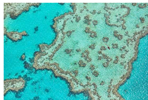
Aerial View – Great Barrier Reef