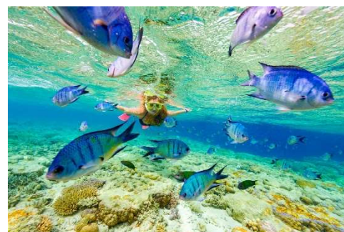
Snorkelling the Great Barrier Reef

Additional charges will apply for extra guests and/or bedding. The above rates are applicable for persons aged 13+ years. Blackout dates: The Snorkel and Explore Experience package is not available over the dates 21 December 2019 – 5 January 2020 inclusive.