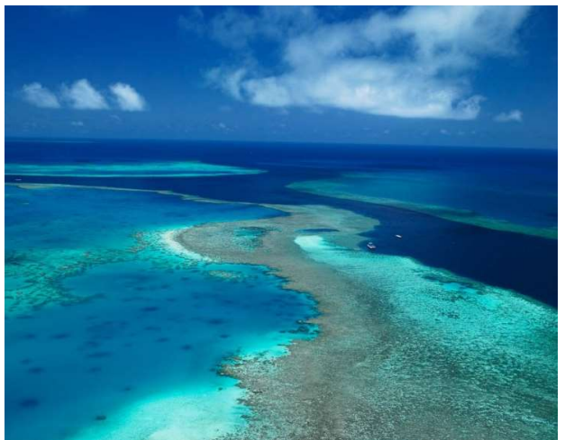
Hardy Reef – Great Barrier Reef

Blackout dates: The Great Barrier Reef Adventure package is not available over the dates 21 December 2019 – 5 January 2020 inclusive. Additional charges will apply for extra guests and/or extra bedding. The above package rates are applicable for persons aged 13+ years. Rates for additional persons 0-12 years inclusive are available on request.