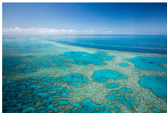
Great Barrier Reef