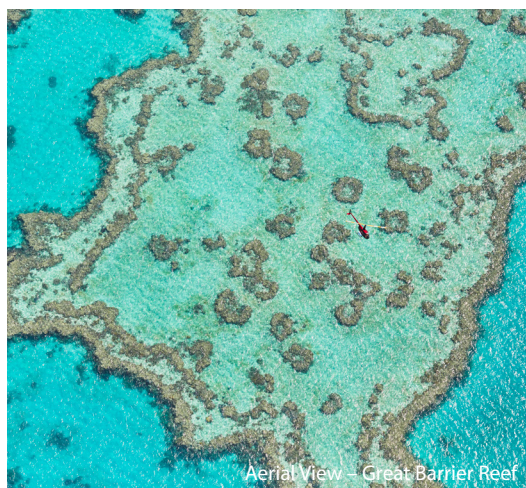
Aerial View - Great Barrier Reef

For reservations call 137 333 (within Australia) or (+61) 2 9433 0444 (outside Australia), email: trade@hamiltonisland.com.au or visit www.hamiltonisland.com.au