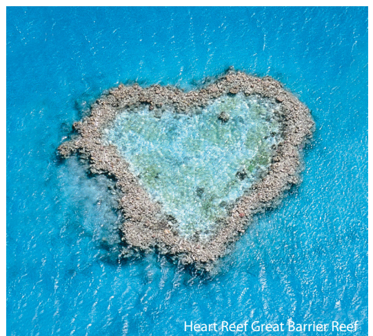
Heart Reef Great Barrier Reef