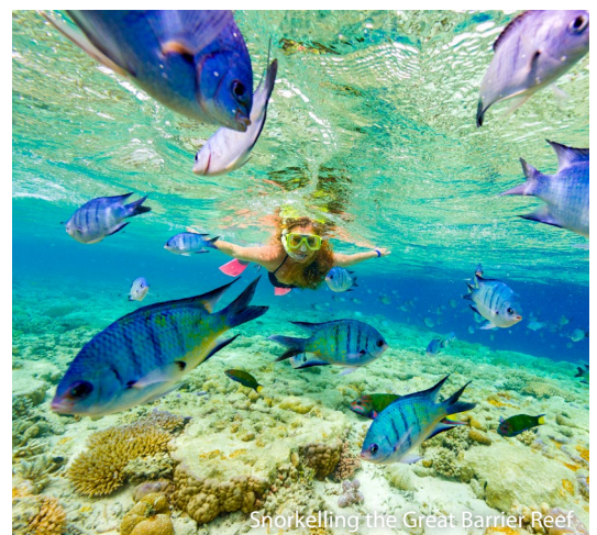
Snorkelling the Great Barrier Reef