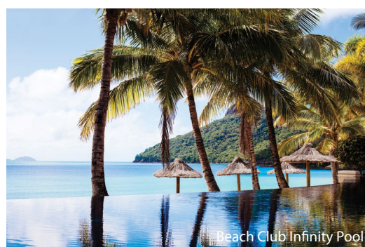
Beach Club Infinity Pool