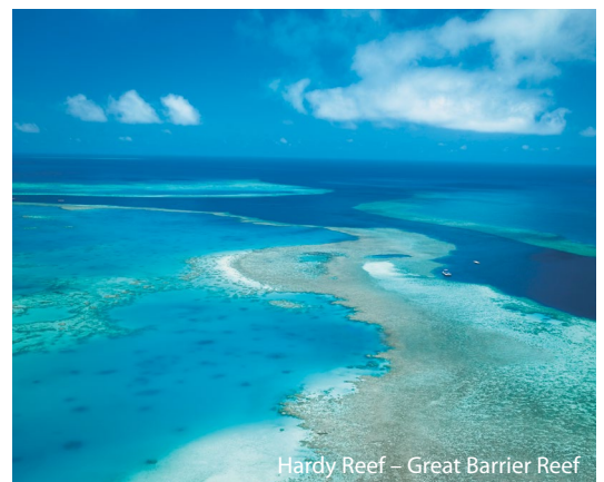
Hardy Reef – Great Barrier Reef

Blackout dates: The Great Barrier Reef Adventure package is not available over the dates 22 December 2020 - 9 January 2021 inclusive. Additional charges will apply for extra guests and/or extra bedding.