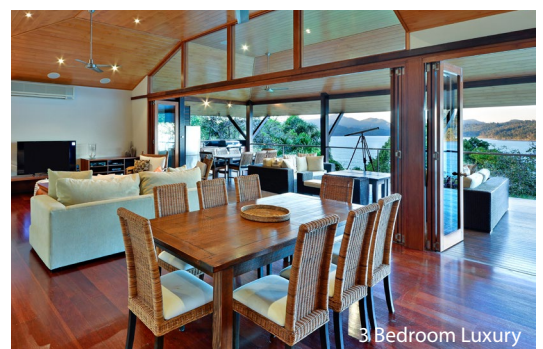
3 Bedroom Luxury

For reservations call 137 333 (within Australia) or (+61) 2 9433 0444 (outside Australia), email: trade@hamiltonisland.com.au or visit www.hamiltonisland.com.au