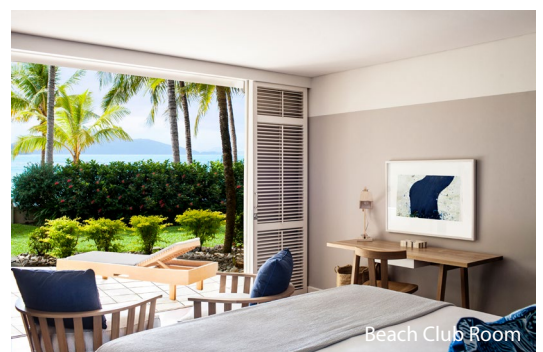
Beach Club Room