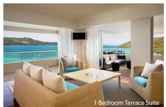
1 Bedroom Terrace Suite

For reservations call 137 333 (within Australia) or (+61) 2 9433 0444 (outside Australia), email: trade@hamiltonisland.com.au or visit www.hamiltonisland.com.au