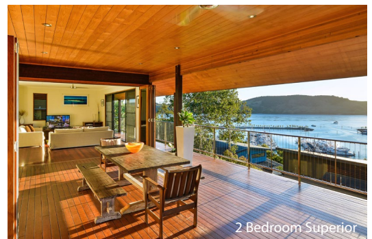
2 Bedroom Superior