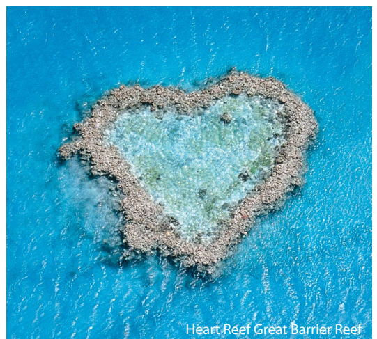
Heart Reef Great Barrier Reef