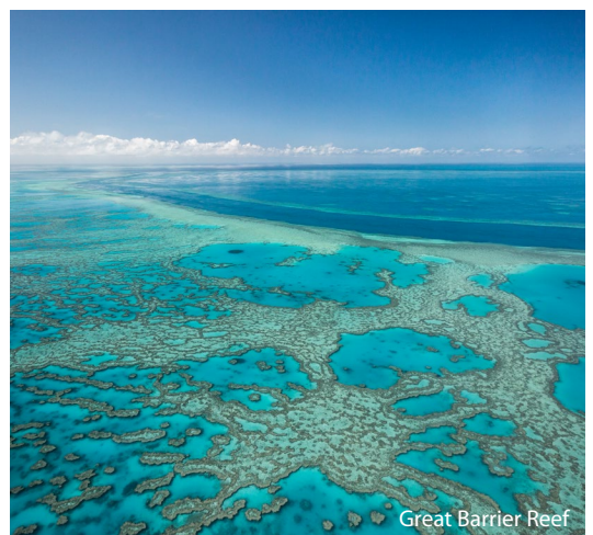
Great Barrier Reef

For reservations call 137 333 (within Australia) or (+61) 2 9433 0444 (outside Australia), email: trade@hamiltonisland.com.au or visit www.hamiltonisland.com.au