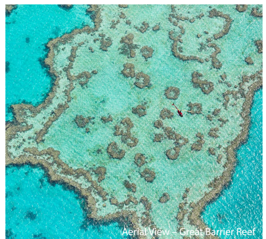
Aerial View – Great Barrier Reef

For reservations call 137 333 (within Australia) or (+61) 2 9433 0444 (outside Australia), email: trade@hamiltonisland.com.au or visit www.hamiltonisland.com.au