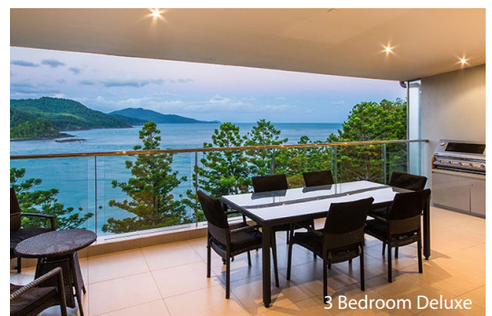
3 Bedroom Deluxe