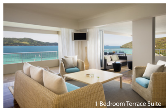
1 Bedroom Terrace Suite

For reservations call 137 333 (within Australia) or (+61) 2 9433 0444 (outside Australia), email trade@hamiltonisland.com.au or visit www.hamiltonisland.com.au