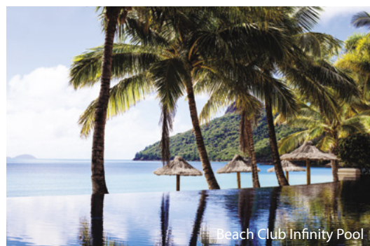
Beach Club Infinity Pool

For reservations call 137 333 (within Australia) or (+61) 2 9433 0444 (outside Australia), email trade@hamiltonisland.com.au or visit www.hamiltonisland.com.au