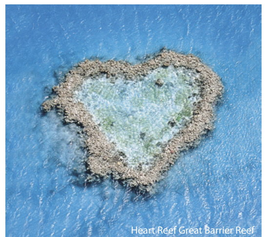
Heart Reef Great Barrier Reef