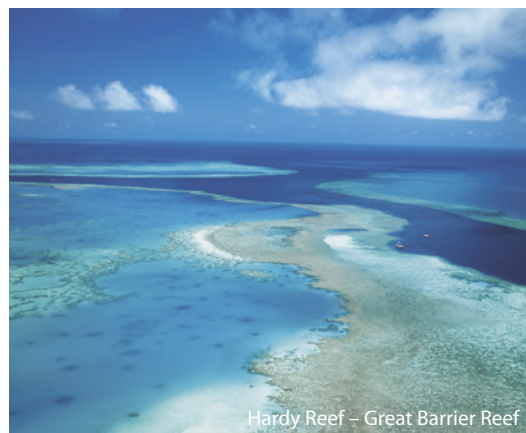
Hardy Reef – Great Barrier Reef

Blackout dates: The Great Barrier Reef Adventure package is not available over the dates 21 December 2022 - 7 January 2023 inclusive. Additional charges will apply for extra guests and/or extra bedding.