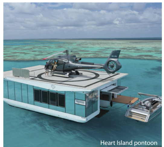
Heart Island pontoon

For reservations call 137 333 (within Australia) or (+61) 2 9433 0444 (outside Australia), email trade@hamiltonisland.com.au or visit www.hamiltonisland.com.au