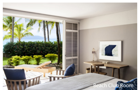
Beach Club Room