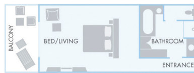
King Coral Sea View Room