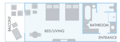
Garden View and Coral Sea View Room