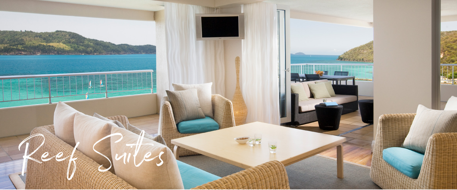
One Bedroom Terrace Suite