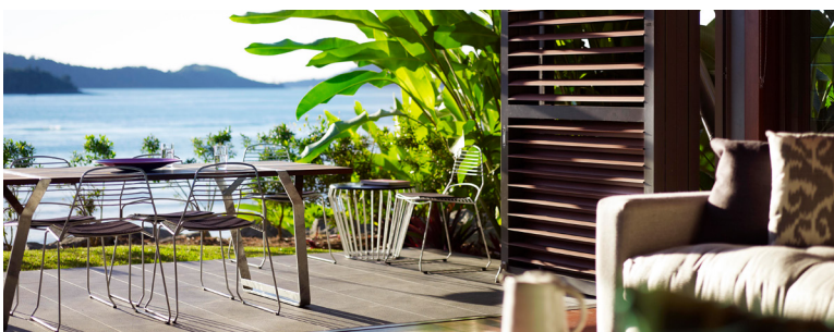
Yacht Club Villa

Max. room capacity: 2 people (Leeward and Windward Pavilions), 4 people (Beach House)