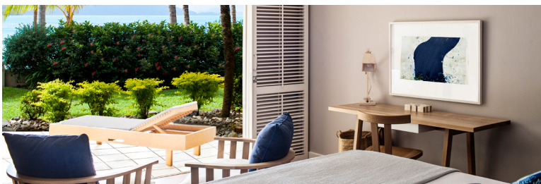
Beach Club Room

Max. room capacity: 4 people (Garden View and Coral Sea View Rooms), 2 people (King Coral Sea View Rooms and Reef Suites), 6 people (Reef Family Room)