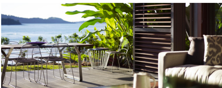
Yacht Club Villa