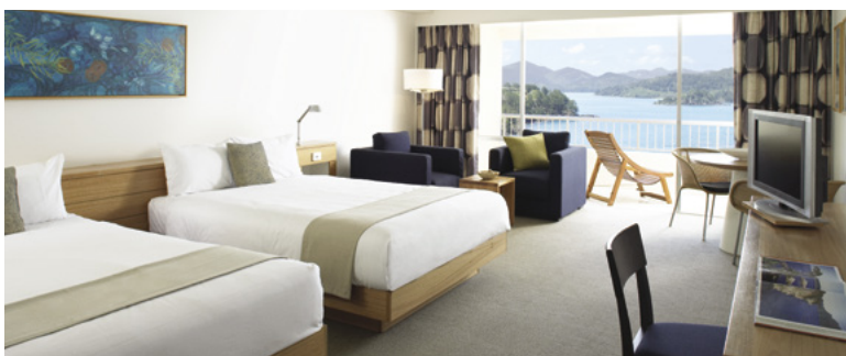
Coral Sea View Room, Reef View Hotel