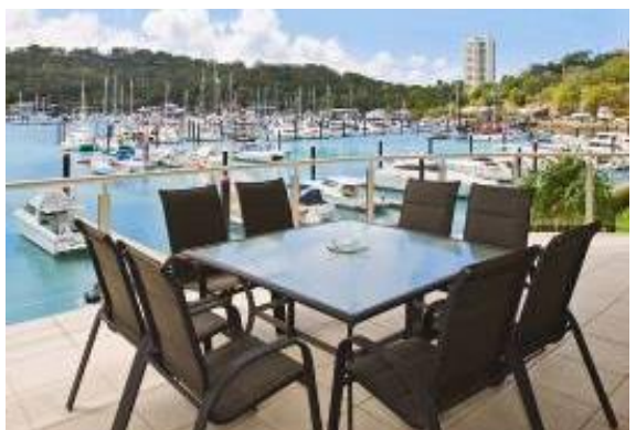
3 Bedroom Luxury