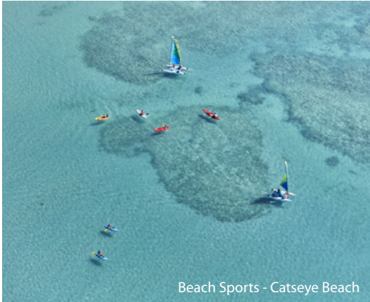
Beach Sports - Catseye Beach