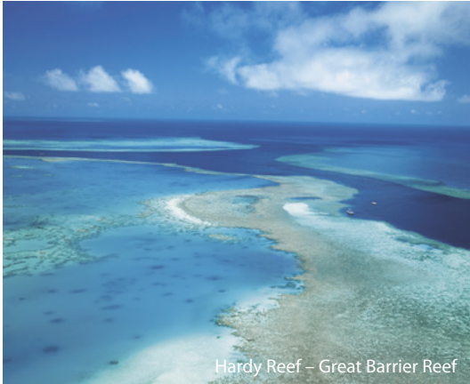
Hardy Reef – Great Barrier Reef

Blackout dates: The Great Barrier Reef Adventure package is not available over the dates 21 December 2023 - 7 January 2024 inclusive. Additional charges will apply for extra guests and/or extra bedding.