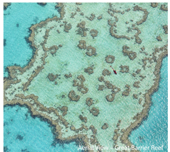
Aerial View – Great Barrier Reef

/ A la carte breakfast in the Beach Club Restaurant / VIP return Hamilton Island airport/marina to Beach Club transfers / VIP chauffeur service for duration of stay / Use of the Beach Club lounge, pool and restaurant