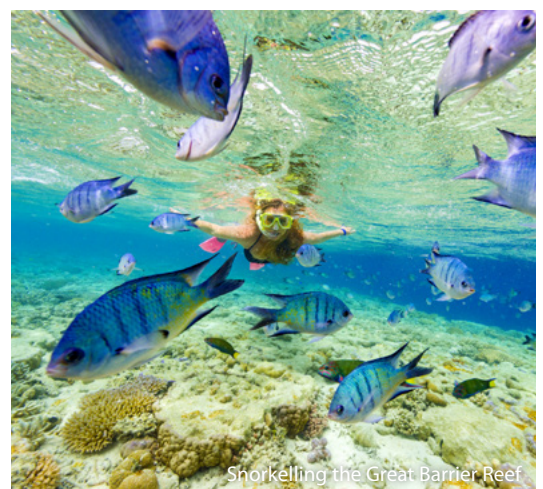
Snorkelling the Great Barrier Reef

Note: Beach Club does not cater for guests under the age of 18 years. Terms and Conditions apply. The above rates are applicable for persons aged 13+ years. Guests must acknowledge that they are a competent swimmer and are competent in English. The tour is booked on the third day of stay.