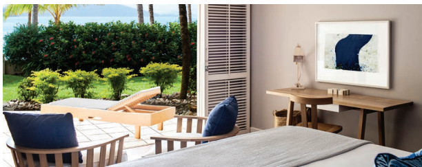
Beach Club Room