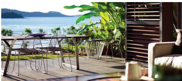
Yacht Club Villa