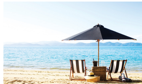
Private beach luxury charter